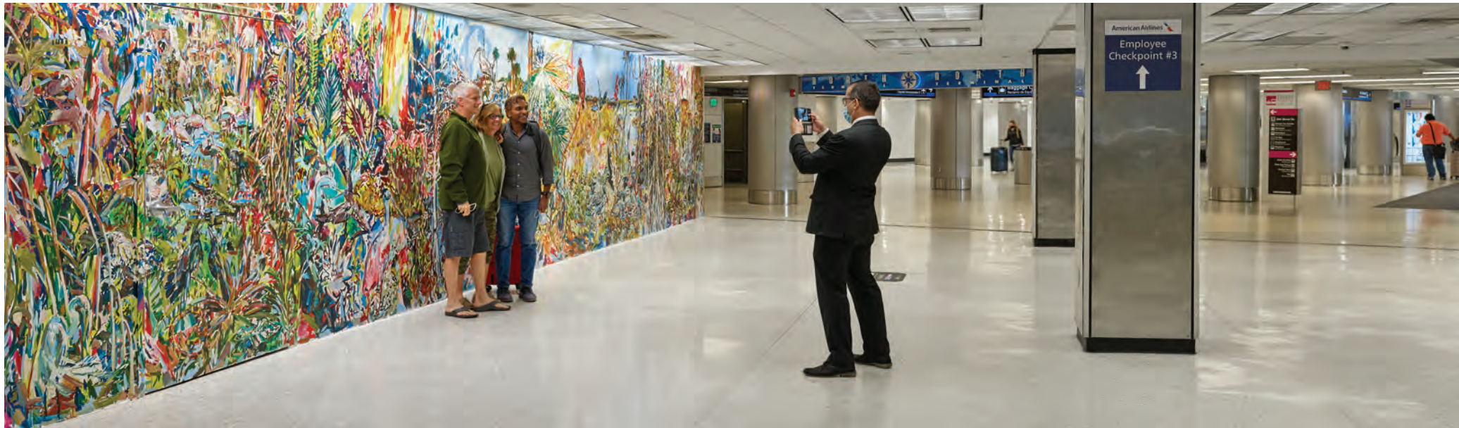
Reflections of Florida Wild, 40'9" x 7'6", mixed-media mural